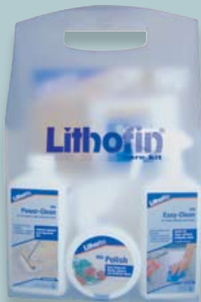
LITHOFIN MN Care Kit 'A' For Bench Tops

Includes: MN Easy-Clean, MN Power-Clean, MN Polish Cream, Microfibre Cloth, Sponge, White Nylon Pad, Yellow Polishing Cloths & Maintenance Instructions