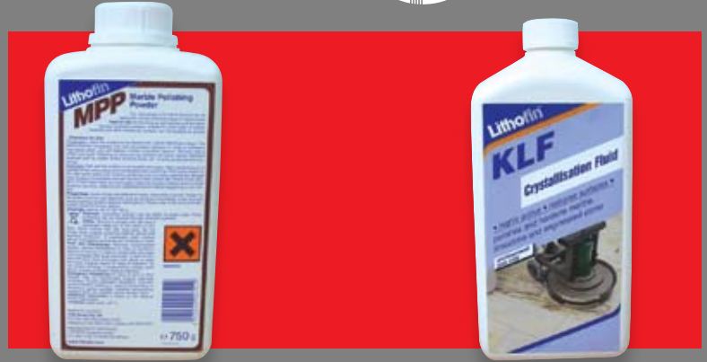
LITHOFIN MPP Marble Polishing Powder

Removes cement films, stubborn dirt residues, rust & efflorescence from acid-resistant Natural Stones. Not suitable for polished Marble & Limestone