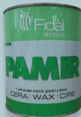
PAMIR Wax 1.0 Litre

Yellow oxalic-acid based polishing powder for Marble & Limestone