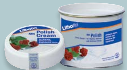
LITHOFIN MN Polish Cream

Solvent based liquid wax For enhancing and polishing Stone surfaces, provides gloss and protection