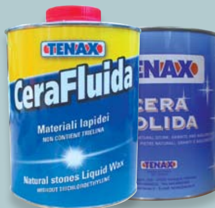
TENAX WAX Solid & Liquid

Solvent based impregnating sealer. Water and Oil repellent