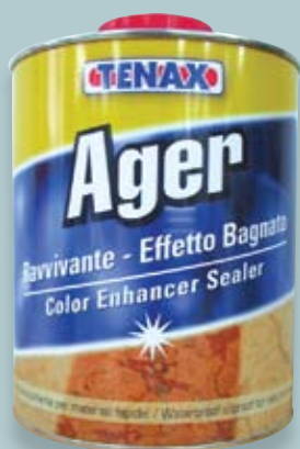
TENAX AGER Colour Enhancing Sealer

Solvent based impregnating water repellent. Creates wet look on honed materials & enhances the colour of polished materials