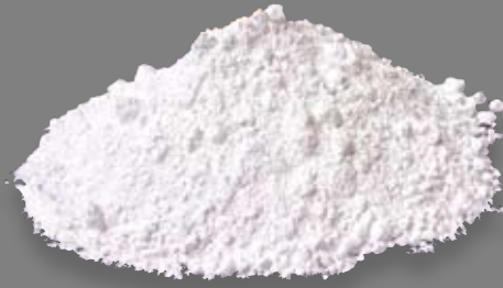
REULIN M Polishing Powder

Premium quality polishing powder for Granite and other hard Stones