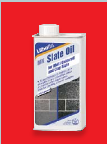
LITHOFIN MN Slate Oil

For protecting & maintaining all coloured and clay Slates. Enhances natural colour and accentuates the structure, improving the appearance of the material. Contains Solvents