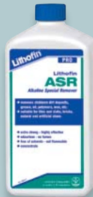
LITHOFIN ASR Alkaline Cleaner

Solvent based wax and oil remover Removes wax layers, sealers, stubborn oil and grease stains, tar, paint and adhesive residues