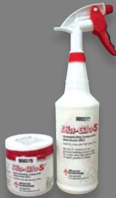
Dia-Glo S Buffing Compound

Produces a high gloss finish on Marble & Terrazzo surfaces