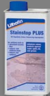
LITHOFIN Stain-stop Plus Colour Intensifying Sealer

Premium quality solvent based impregnating sealer for absorbent Natural & Engineered Stones. Enhances the colour, accentuates the structure and makes water and dirt repellent