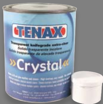
TENAX CRYSTAL Solid Polyester Resin

Water clear adhesive paste used for glueing and repairing Stone