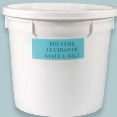
TENAX 5 Extra Powder 1.0Kg

Yellow oxalic-acid based polishing powder for Marble & Limestone