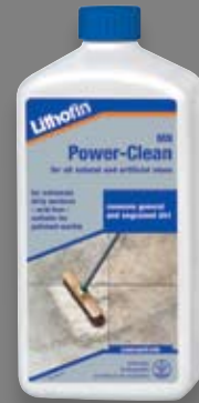
LITHOFIN MN Power-clean Alkaline Cleaner

Cleans, enhances & maintains the surface of all types of stone in one action ideal for impregnated or sealed surfaces