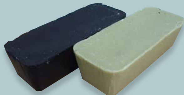
HARD WAX BAR Buffing Wax

White polishing compound for use with calico buffs