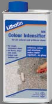
LITHOFIN MN Colour Intensifier Colour Enhancing Sealer

Premium quality water based impregnating sealer. Provides optimal protection against oil, grease & water for absorbent Natural & Engineered Stones