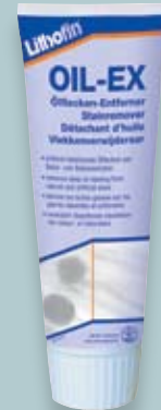
LITHOFIN Oil-ex Oil Stain Remover

Special alkaline cleaner. For removing extremely stubborn dirt layers, grease, oil, wax and polymer films