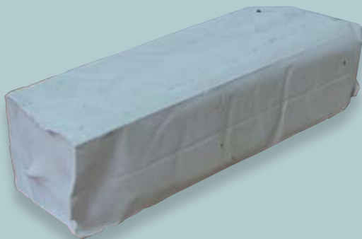
HYFIN Polishing Paste Bar

White polishing compound for use with calico buffs