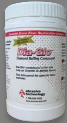
Dia-Glo L Dia-Glo D Buffing Compound

Two component system for polishing black Granite. Ideal for restoring shine and depth of colour