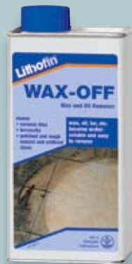
LITHOFIN Wax-off Wax & Oil Remover

Solvent based wax and oil remover Removes wax layers, sealers, stubborn oil and grease stains, tar, paint and adhesive residues