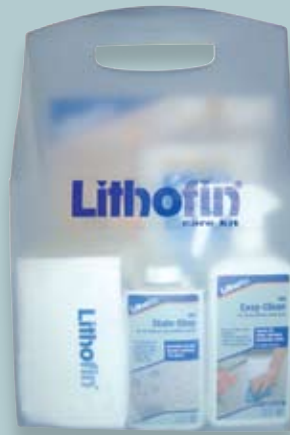
LITHOFIN MN Care Kit 'D' For ???

Includes: MN Easy-Clean, MN Power-Clean, MN Polish Cream, Microfibre Cloth, Sponge, White Nylon Pad, Yellow Polishing Cloths & Maintenance Instructions