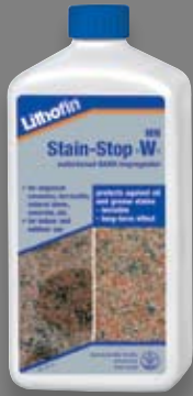
LITHOFIN MN Stain-stop >W< Impregnating Sealer

Premium quality water based impregnating sealer. Provides optimal protection against oil, grease & water for absorbent Natural & Engineered Stones