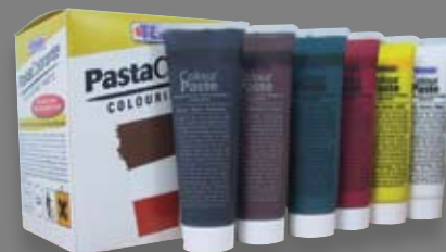
TENAX COLOUR Pastes For Polyester Resin

Opaque adhesive paste used specifically for glueing and repairing white and crystalline Marble & Stone