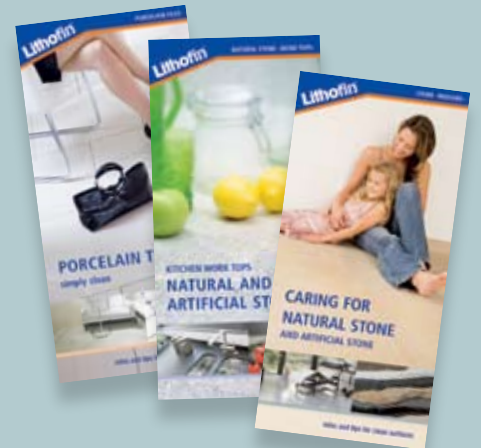
LITHOFIN Information Leaflets

Natural and artificial stone information leaflets available free of charge for your customers