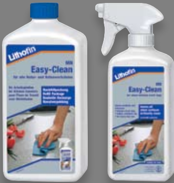
LITHOFIN MN Easy-clean Spray Cleaner

For every day cleaning of small stone surfaces such as kitchen bench tops, table tops, bathroom vanity tops & wall tiles