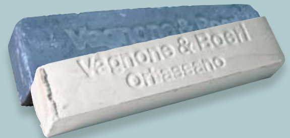
BUFFING CHALK 750g

Paraffin based wax for polishing Marble and Granite Available in clear or black