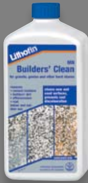
LITHOFIN MN Builders' Clean Acidic Cleaner

Removes cement films, stubborn dirt residues, rust & efflorescence from acid-resistant Natural Stones. Not suitable for polished Marble & Limestone