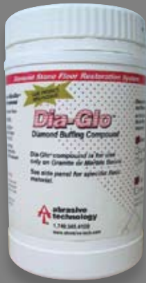
Dia-Glo M Buffing Compound

Produces a high gloss finish on Marble & Terrazzo surfaces