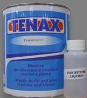
TENAX THASSOS Polyester Resin

Water clear adhesive paste used for glueing and repairing Stone