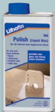
LITHOFIN MN Polish Liquid Wax

For protecting & maintaining all coloured and clay Slates. Enhances natural colour and accentuates the structure, improving the appearance of the material. Contains Solvents