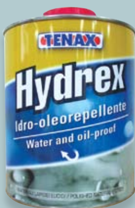
TENAX HYDREX Impregnating Sealer

Solvent based impregnating water repellent. Creates wet look on honed materials & enhances the colour of polished materials