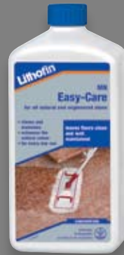
LITHOFIN MN Easy-care Maintenance Cleaner

For every day cleaning of small stone surfaces such as kitchen bench tops, table tops, bathroom vanity tops & wall tiles