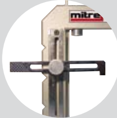
Fascia Retaining Arm