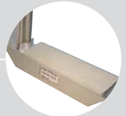
White Rubber Base Plate