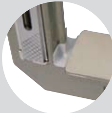
Disposable Glue Catcher