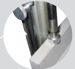
Fascia Clamping Rod